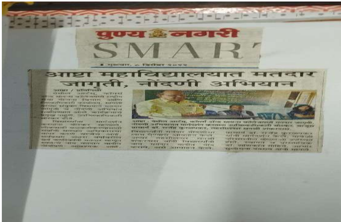
VOTER'S AWARENESS AND REGISTRATION CAMPAIGN