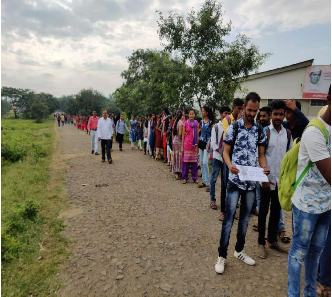
AIDS Awareness Rally