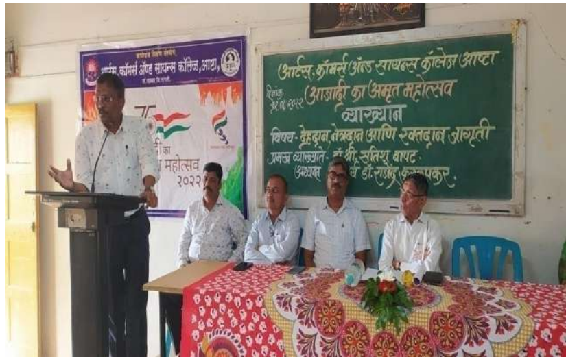
Organ and Body Donation awareness camp