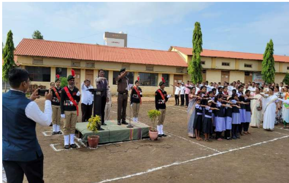
Celebrating Independence Day on 15 th August 2022