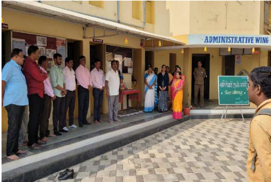
Celebrating Birth-Anniversary of Krantijyoti Savitribai Phule