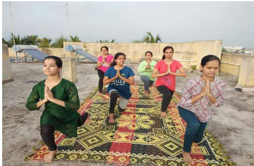
Celebrating Yoga Day