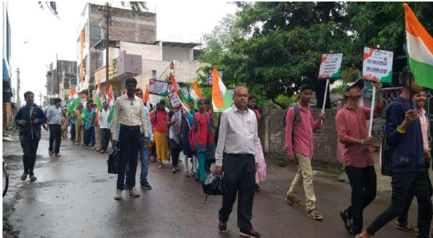
National Flag Rally