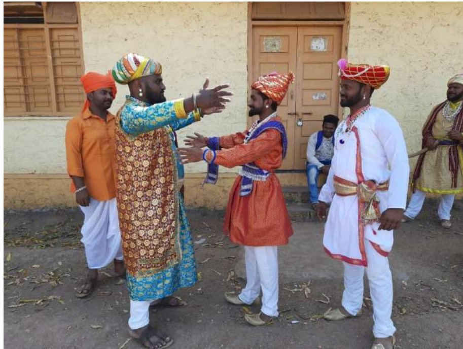
Birth-Anniversary of Chhatrapati Shivaji Maharaj