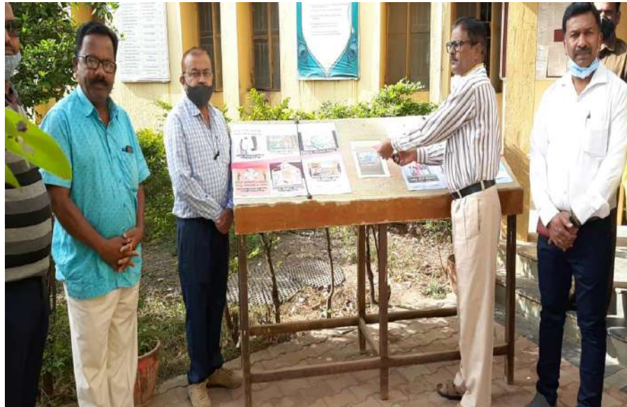
Celebrating National Voters Day