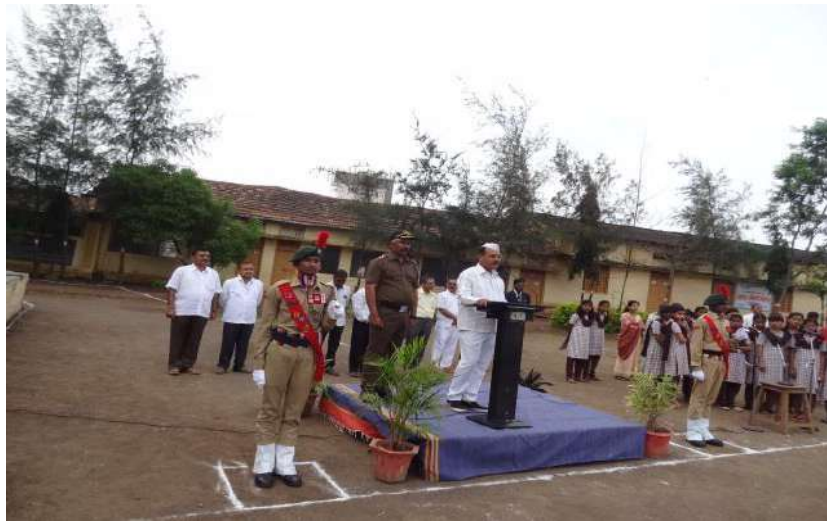
Celebrating Republic Day