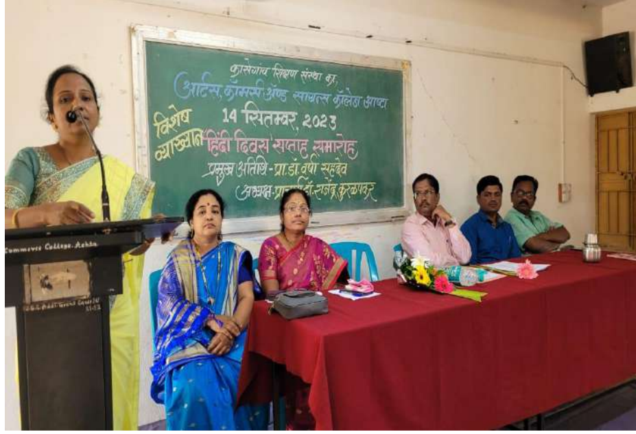
Celebrating Hindi Din