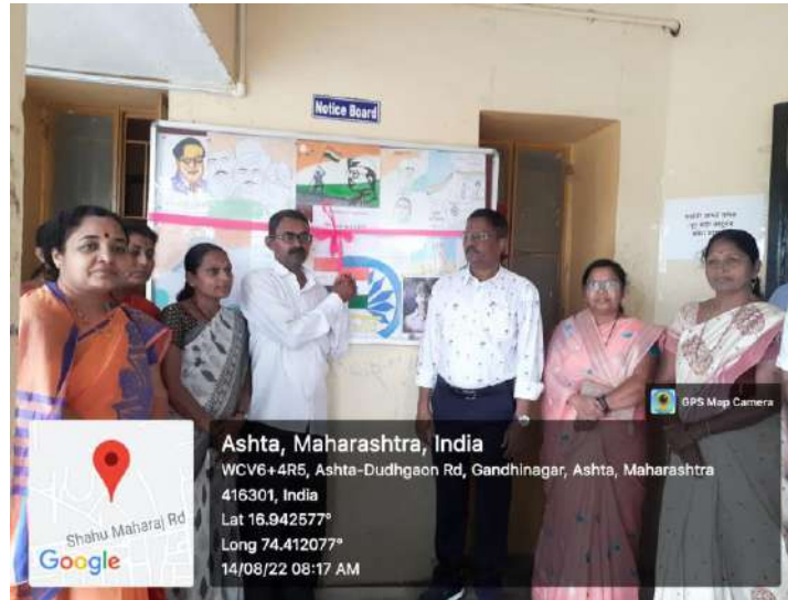
August Kranti Din