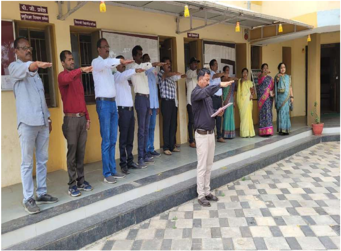
Celebrating Constitution Day