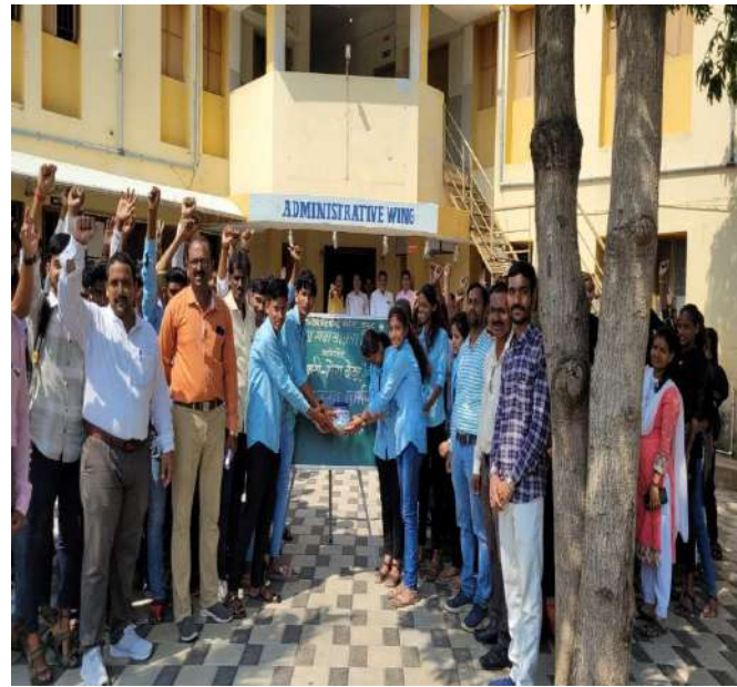
Panch Pran Oath and Amrut Kalash