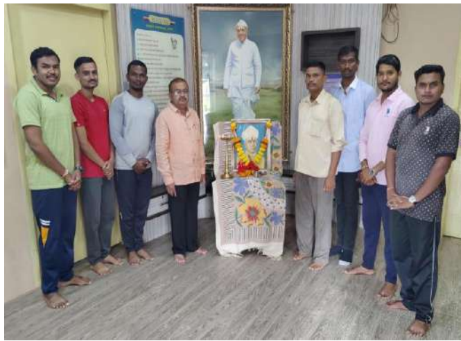
Celebrating Birth-Anniversary of Mahatma Gandhi